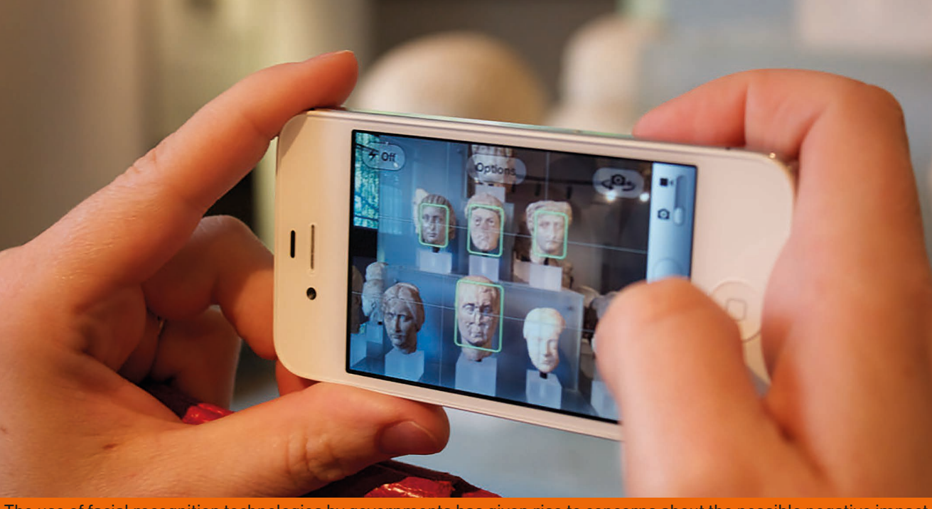
The use of facial recognition technologies by governments has given rise to concerns about the possible negative impact on human rights and fundamental freedoms.

Within the ambit of inappropriate use of the technology, the Toronto Declaration, released during RightsCon 2018, highlighted the obligation of governments and tech companies to prevent machine-learning systems discriminating, and in some cases violating, existing human rights law.