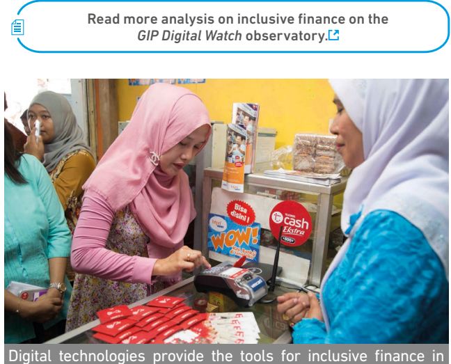
Digital technologies provide the tools for inclusive finance in economies worldwide.

Inclusive finance can also impact taxation systems. Having online payment systems in place can help improve the collection of taxes and reduce the black economy, by providing immutable evidence of transactions and reducing transaction costs in tax administration.