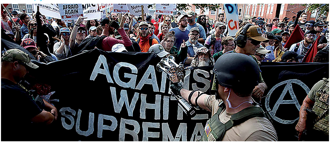
Content filtering and freedom of speech came into the limelight after some Internet companies decided to block access to the online content of white supremacist organisations, following the Charlottesville confrontations.

One of governments' main concerns is that the Internet industry may not be doing enough. Concerned over the industry's inability to block such content before it gets online, the British Home Secretary emphasised that such content 'should never be there at all'.