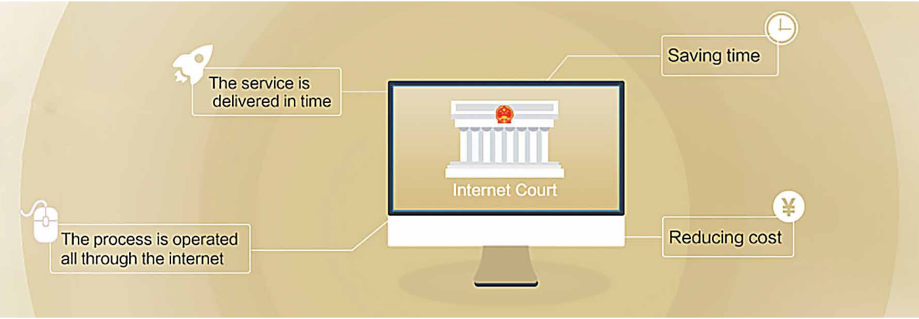
The litigation platform.

However, since the court is still in its early days, it remains to be seen under which jurisdiction the court will actually operate, and whether it will also deal with cases of a crossborder nature that do not involve Chinese companies.